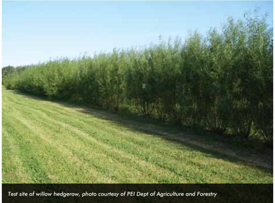
Test site of willow hedgerow

The 2013 NAAC conference will feature a special speaker on agricultural landscapes in Brittany and Normandy and the value and impact of trees in those landscapes. With its blend of farm, forests and water, PEI has a similar landscape so Island land owners could benefit from these insights. Many useful trees and shrubs grow in Island hedges and forest edges and these plants could provide new product lines and income for land owners, while maintaining the benefits of healthy buffers. Other topics may include potential climate change impacts and the adaptive capacity of agriculture, ecological sustainability of biomass and biofuel production systems, and carbon sequestration through agroforestry systems.