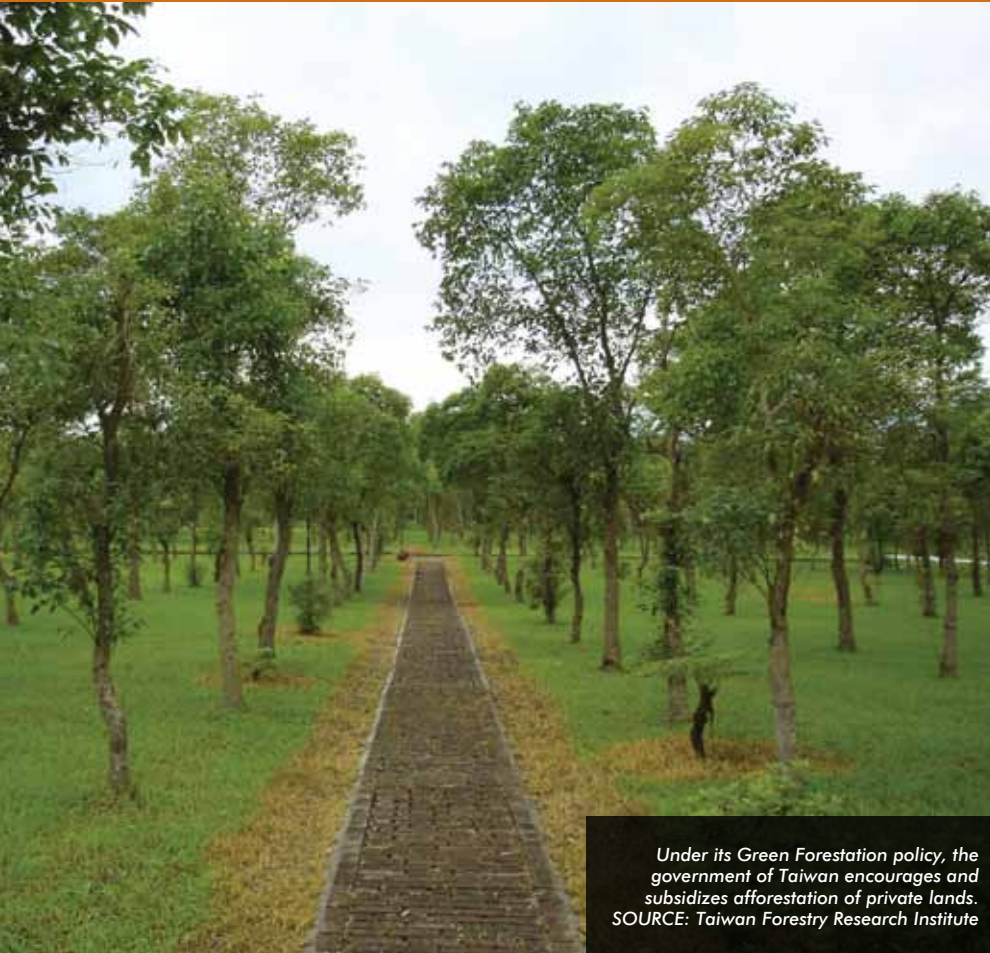
Under its Green Forestation policy, the government of Taiwan encourages and subsidizes afforestation of private lands.

Taiwan, an island nation in the western Pacific near China, is a surprisingly rich and varied landscape. With an area of just 36,193 square kilometers, slightly less than New Jersey and Connecticut combined, Taiwan has a population of about 23.3 million, making it one of the most densely populated countries in the world. Nonetheless, the island is home to 8,335 flora species, 36,303 fauna species, and 11,432 other species—more than 50,000 different species in total, of which around 30 percent are endemic. Taiwan