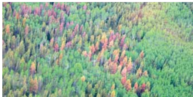
Pine in area of discontinuous attack showing red trees (2010 attacks) and faders (2011 attacks)

A small patch containing a few “faders” was mapped near Aeroplane Lake, approximately 80 kilometres south of the Yukon border. There was, however a significant northern movement to the east of the Rocky Mountain trench. Populations had apparently crossed the height of land between this creek and Matulka Creek to the south, where some mortality had been recorded the previous year.