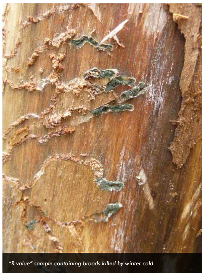
"R value" sample containing broods killed by winter cold

In most cases of severe winter mortality, it was possible to find a small surviving population at or near the root collars of the trees, where the broods were insulated from the severe cold by a layer of snow. Examples of survival were found at some of the sites but time constraints precluded a comprehensive examination to determine frequency and abundance. These progeny will have matured into adults later in the summer, and emerged from the trees to attack new hosts. In addition, examination of a few of the red trees (attacked in 2010) found small numbers of preflight adults that had failed to mature in 2011. These beetles will have emerged within the next few weeks, but the population was small and unlikely to overcome normal tree defenses.