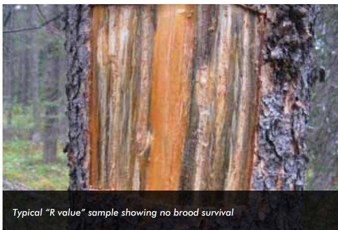
Typical "R value" sample showing no brood survival

The assessment consisted of removing 225cm 2 (15 cm X 15 cm) bark samples at breast height (1.3 m) from the north and south sides of each of 10 trees per site and counting the surviving broods. No living progeny were found in any of the 172 samples (Photo 2). Note only six trees were sampled at one site. Heavy woodpecker debarking was seen at all sites. Little or no larval development was seen in most samples.