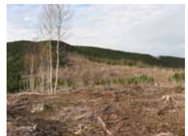
Clockwise: Logging Trees; Flagging planting strips in early June; Cutovers in spring; Cutovers in early May near Corner Brook