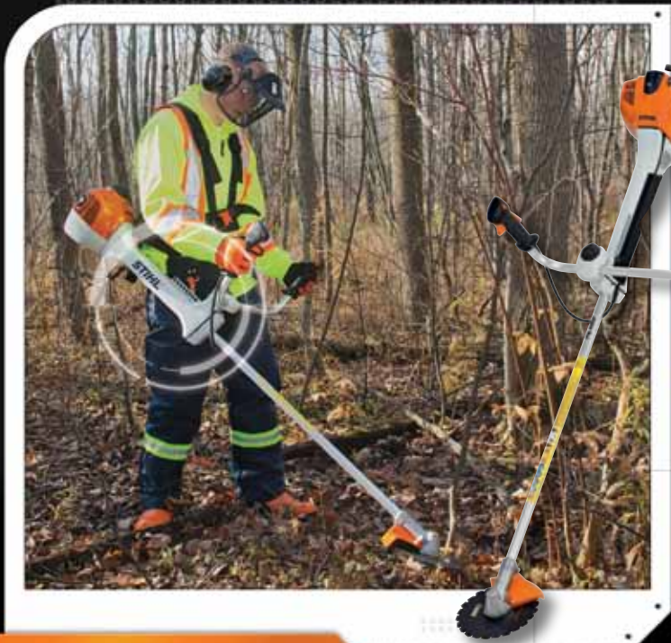
FS 460 C-EMK Clearing Saw