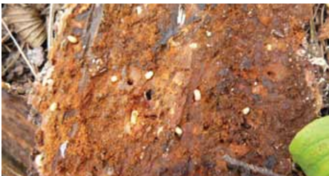
Surviving larvae at the base of a tree attacked in 2011